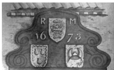
Photos of the building and plaque in the late 19th century reproduced from 'A Visit to Southwold' by Barrett Jenkins. Below, the 19th c house now on the site which has a version of the plaque on its wall.