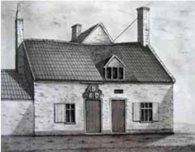
Engraving by Hamlet Watling, 1848

Some books about Southwold have conjectured that this little building on South Green, long demolished, was the original town hall. This idea, which is almost certainly wrong, probably stems from the fact that it bore the town's coat of arms above the front door.